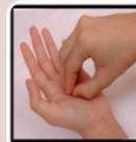
Rotational rubbing, backwards and forwards with clasped fingers of right hand in left palm, and vice versa