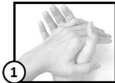
Palm to palm

You can use any of the following: soap and water, alcohol or alcohol-based handrub disinfectant. Repeat each step below five times.