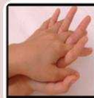
Back of fingers to opposing palms, fingers interlocked