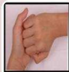
Palm to palm, fingers interlaced