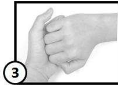
Palm to palm, fingers interlaced