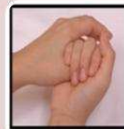
Rotational rubbing of left thumb clasped in right hand, and vice versa