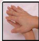
Right palm over dorsum, and vice versa