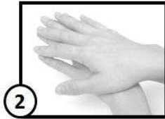
Right palm over dorsum, and vice versa