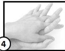
Back of fingers to opposing palms, fingers interlocked